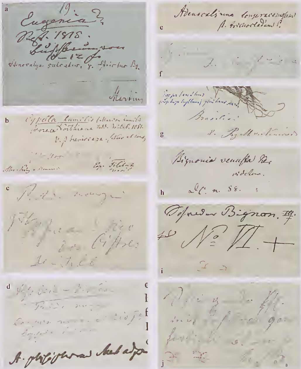
Figure 8. Label detail. a. MEL 2353741. Scripsit Wied: "19./ Eugenia/ Sept. 1815/ Buschbaum van 10–12 f. [= shrubby tree of 10–12 ft]"; Scripsit Berg: "Stenocalyx sulcatus \gamma strictus Bg./ Martius"; b. MEL 2355228. Scripsit Wied (in pencil): "Ist der [...] / Str[a]be d[es] Capt. Filisbert"; Scripsit Nees: "Moraea Northiana v. \beta brevicaapa"; Scripsit Klatt: "Cypella humilis (Marica humilis Ladd., Bot. Cab. 1081)"; Scripsit Sander: "(Nees ab Esenb.)/ Max. Prinz. v. Neuwied/ Capa Fili[s]berta/ Brasil"; c. MEL 2331220. Scripsit Wied: "Pentandr[ia] monogynia/ zwisch[en] St. Juan – Ria dos Oistres/ Bl[ume] weißgelblich [= flower whitish-yellow]"; d. MEL 2341135. Scripsit Wied: "Alsodeia – Violaceae/ Pentand[ria] managyn[ia]/ Campas novas et Rio Jo./ Capsula tricacca/ A. physiphara Mart. [...]"; e. MEL 2353803. Scripsit Martius: "Adenocalymna longiracemasum \beta trichacladum"; f. MEL 2353803. Scripsit Wied: "Bignonia/ Str[a]be d[es] Capt. Filisbert"; g. MEL 2353747. Scripsit Sander: "Brasilia/ Pr. M. v. Neuwied". Scripsit Koernicke: "Paepalanthus (Lophophyllum) fluitans Mart."; h. MEL 2353799. Scripsit Martius: "Bignonia venusta Ker/ videtur/ DC. n. 88"; i. MEL 2353799. Scripsit Wied: "Schraden Bignon./ No. VI +"; j. MEL 2353799. Scripsit Wied: "Schlingende Pfl./ mit hoch Orangen/ farbigere Blumen/ R.B. [= twining plant with highly orange colored flowers/ Rio Belmante]".